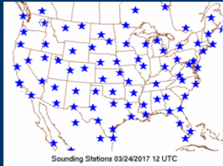
Sounding Stations 03/24/2017 12 UTC